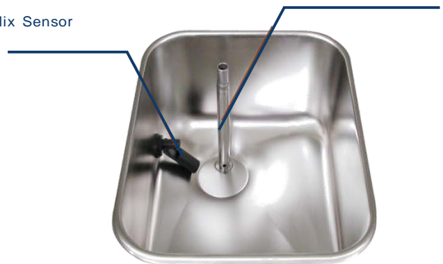
Low Mix Sensor